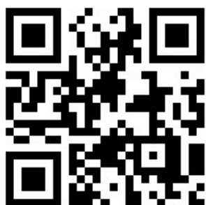
iGRAM (IGNOU Grievance control Room)