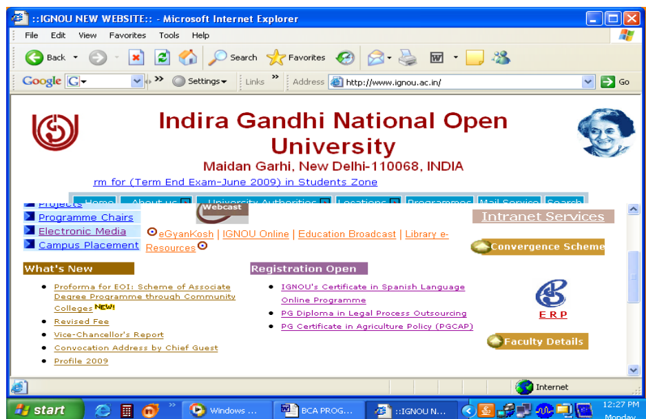
Figure 1: Home page of IGNOU website-http://www.ignou.ac.in