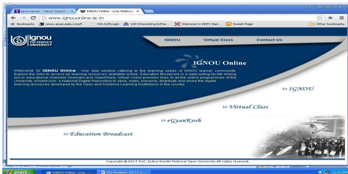
Figure: IGNOU Online Portal Web Page

lectures and Interactive Radio Counselling Program (IRC) can be seen on http://www.ignouonline.ac.in/