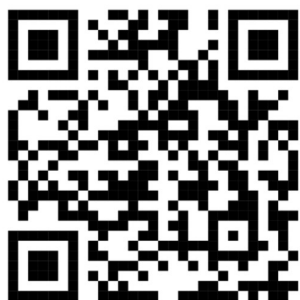
iGRAM (IGNOUGrievance Redressal and Management)