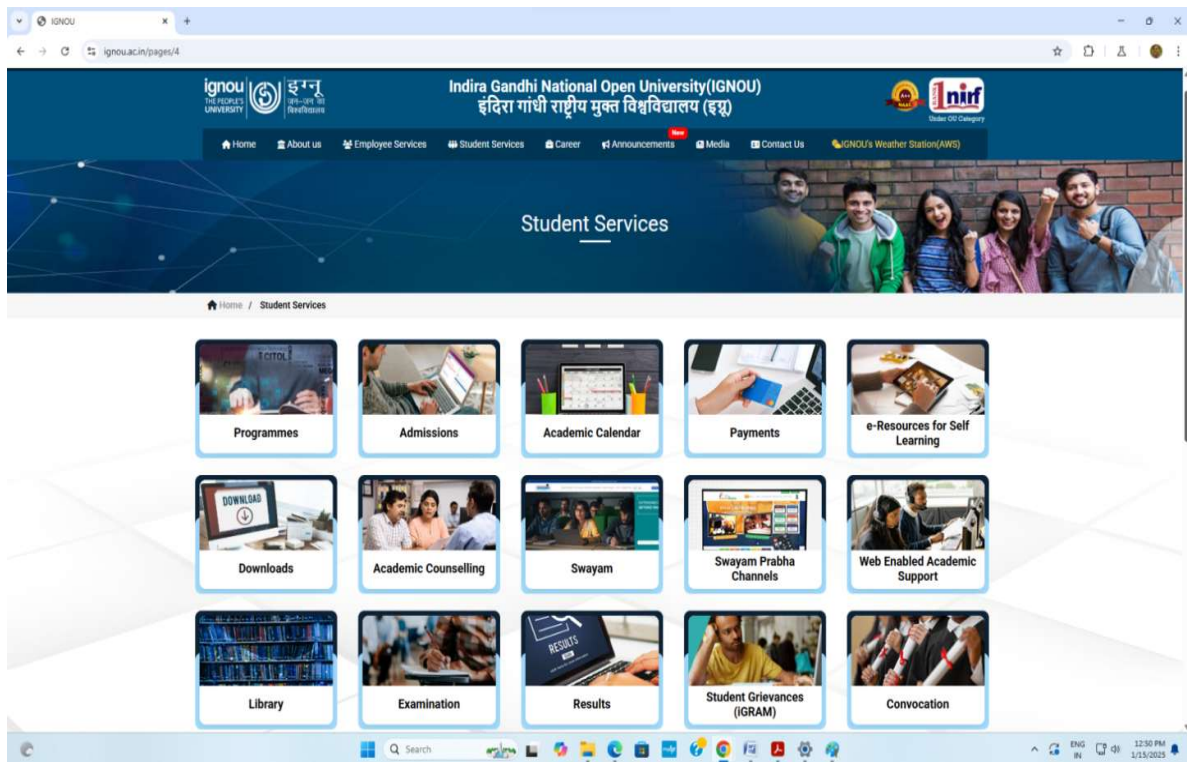
Figure 3: Student Services Page

One of the most important link for students is Student Services which can be reached from Home page by selecting Student Services option. Figure 3 displays the options of the Student Services.