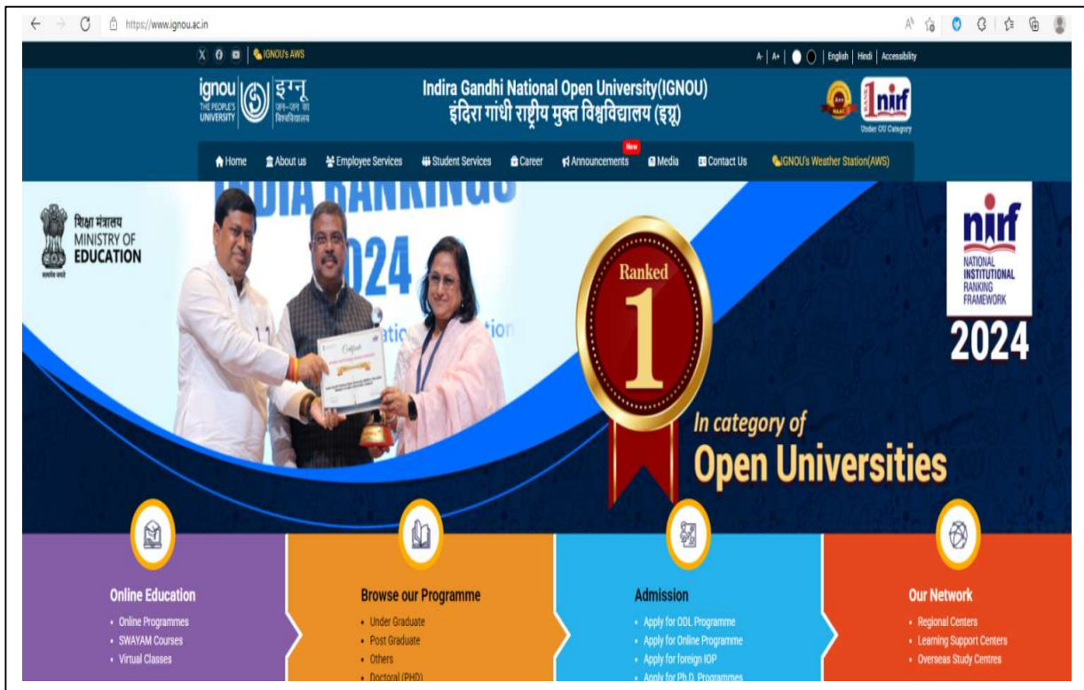
Figure 1: IGNOU Website

The learners can have access to IGNOU's website at the following address (URL) http://www.ignou.ac.in . As students get connected to this site, the following page displays the Home Page of IGNOU's web site (Figure 1). Students need to click on various options to get the related information.