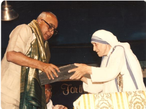
With Mother Teresa