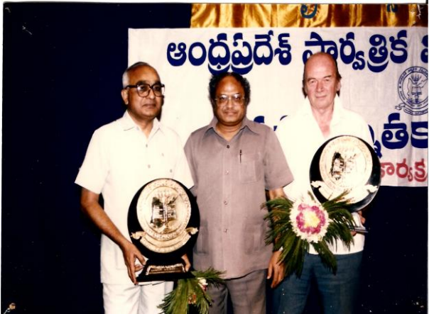
Receiving Doctorate Degree from APOU