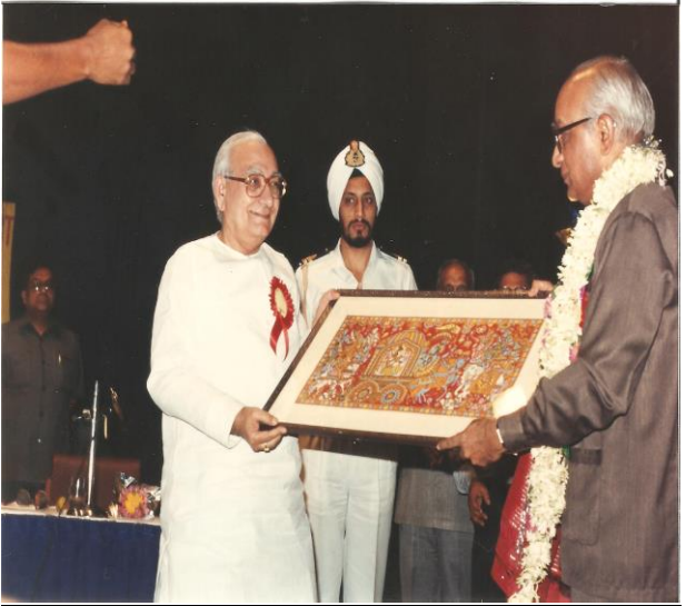
Receiving Award from 10 th Vice President of India, Krishan Kant